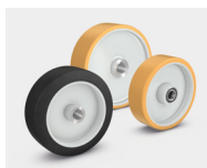
Load and drive wheels