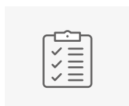
Large standard range/stock